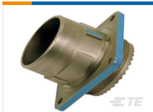
TE Part # YDIV46E21-35PNC009 PLUG ASSY