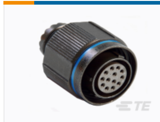
TE Part # YDTS26W25-35PNV001 PLUG ASSY