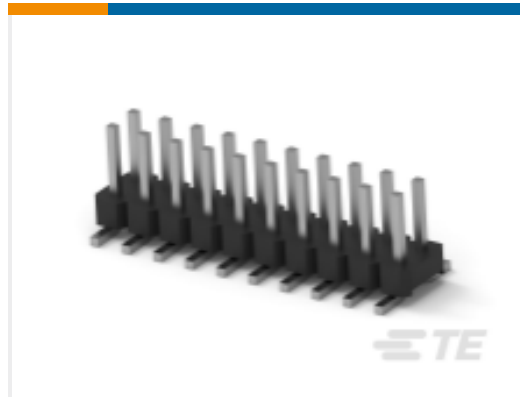
TE Part # 1-2842142-0 20P,2MM,BRK HDR,DRV,T,SMD,0.1AU, TR W/CAP