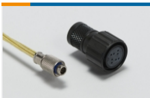
Standard Circular Connectors(2587)