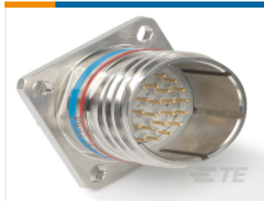
TE Part # YDTS20W21-35PNV001 D38999: Square Flange, 21-35 insert