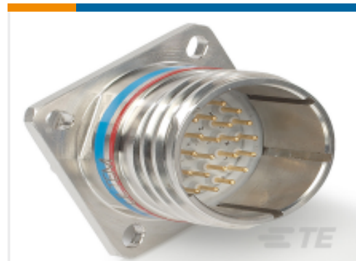
TE Part # YDTS20W23-35SCV001 RECP ASSY