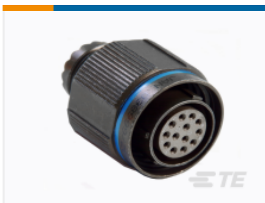
TE Part # YDTS26W21-35PBV001 PLUG ASSY